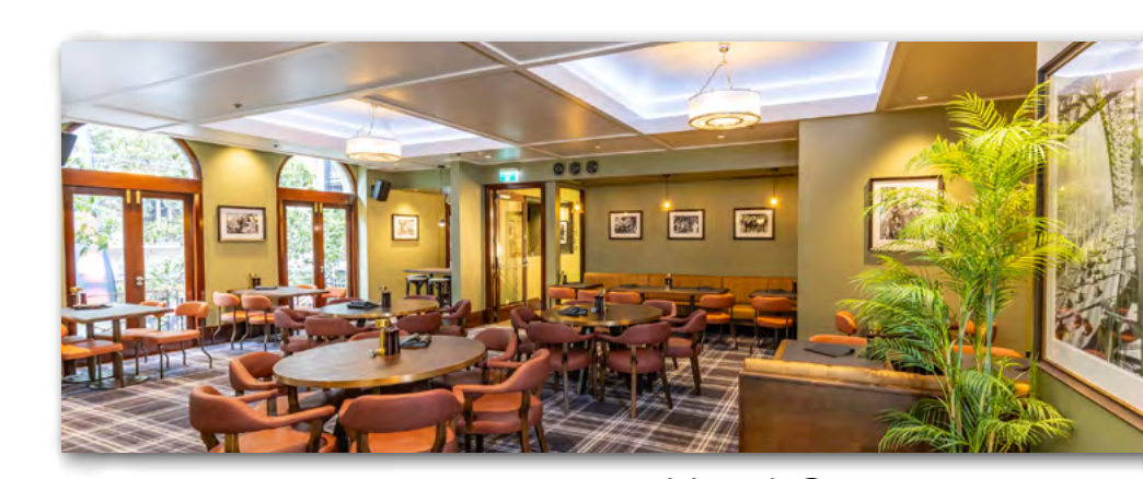
Hotel Coronation 5-7 PARK STREET, SYDNEY CBD | www.hotelcoronation.com.au